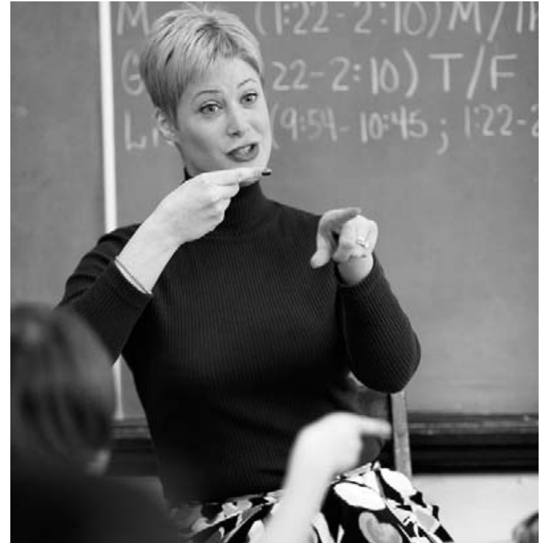
A person who speaks English and American Sign Language is bilingual.